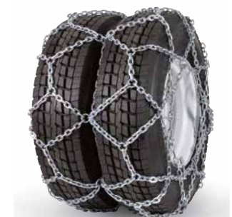
pewag austro super reinforced twin