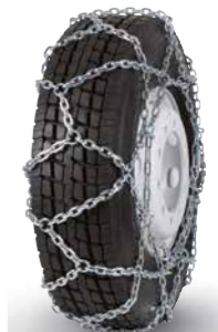
pewag austro super reinforced