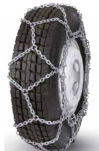
pewag austro super