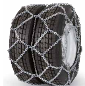
pewag austro super twin